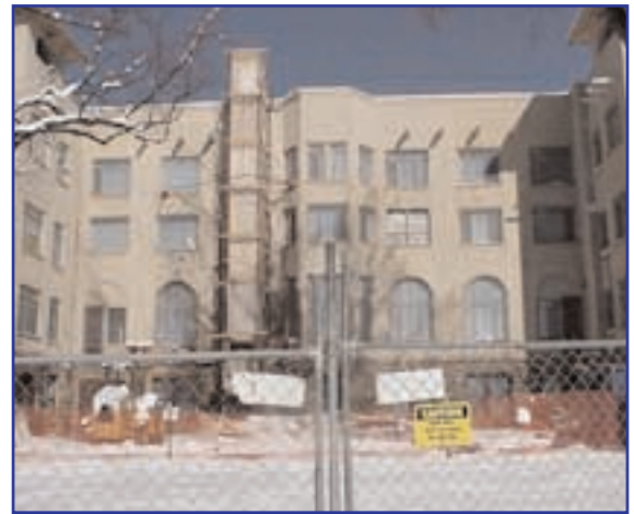
Historic Main Hall, now being renovated, used to be part of the Cragmor Tuberculous Sanatorium.

While the costs raised the eyebrows of some legislators and state non-elected officials, completing the project remains a high-priority given the historic nature of the building. Main and Cragmor halls were originally constructed as part of the Cragmor Tuberculous Sanatorium and became the university's first buildings when CU-Colorado Springs was founded in 1965.