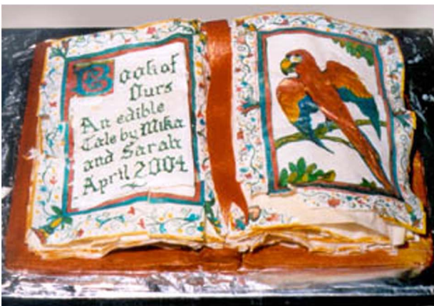
"Book of Ours"