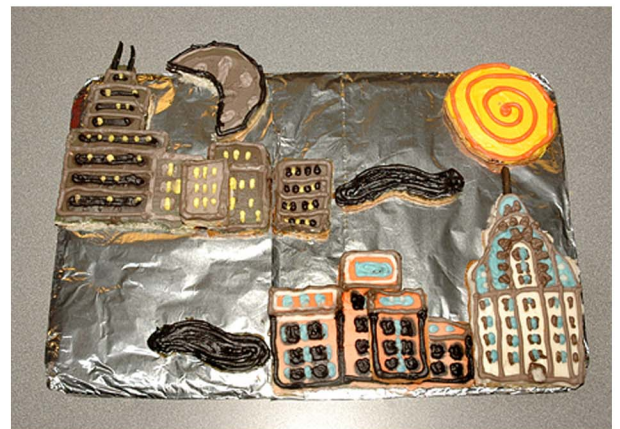
"Tale of Two Cities"