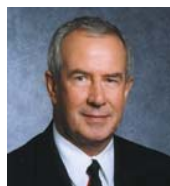
Maurice P. McTigue

industry through the creation of conservation incentives. He also served as Minister of Employment, of State Owned Enterprises, of Railways, of Works and Development, of Labour and of Immigration.